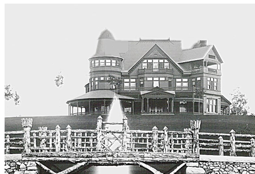
White Cliffs Mansion as built

https://www.youtube.com/watch?v=u8YuIhcJ3dw&list=PLk479TOxptkUMmJhpNBbHG9PmchRBUmIb&index=1