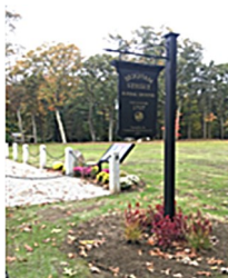
Improved Brigham St Burial Ground