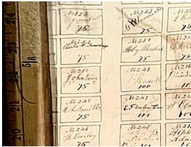
1851 Cemetery Plot Plan Extract