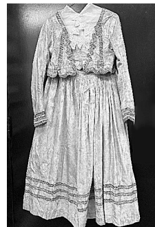
Lydia's pink velvet ball dress from the 1830s

Back in 2019, another branch of the family (Graves) donated letters, diaries, books and photo albums. We now have a wonderful record of the family that lived and served the town for five generations.