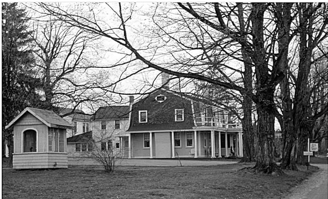
Green Acres Nursing Home

In a 1972 article about Green Acres Nursing Home located near the intersection of Whitney Street and Rice Avenue, several residents of the area were complaining about the vandalism to the building which had been empty for 3 years. My grandparents, with whom I spent a lot of time during my school years, lived on Whitney Street, and I remember seeing the nursing home quite often from their home.