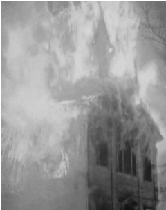
A Historic Church Burns

Next Board of Directors Meeting Tuesday, January 9