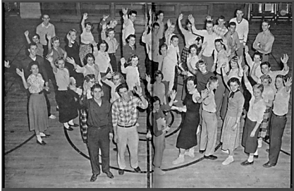
Class in gym

The Northborough High School Association looks forward to many more annual meetings. Since the last graduating class from Northborough High School was the Class of 1959, participation of later graduating classes is encouraged. Let's keep these reunions going for many years to come! Correspondence can be addressed to P.O. Box 693, Northborough, MA 01532. The next Northborough High School Alumni Association Reunion will be this year, September 30, 2023, from 12 noon - 4 p.m. at the Haven Country Club.