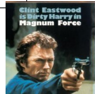
Quote from Dirty Harry Movie 1973, This is a 44. Magnum, the most powerful handgun in the world....