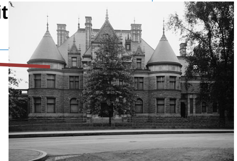
Springfield Home Completed: 1898 Burned Down: 1966