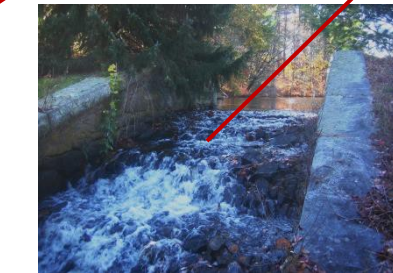
Bartlett Pond Spillway