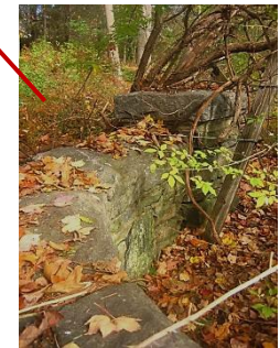
Bartlett Pond Spillway