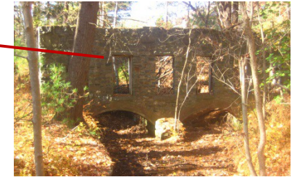
Pumping Station Today