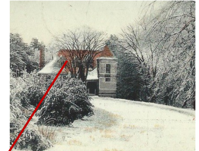
Pumping Station in 1880's