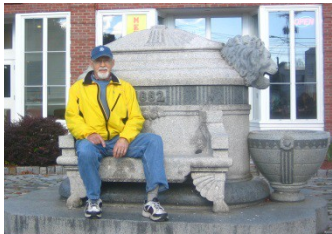
Lion Fountain in Town Center