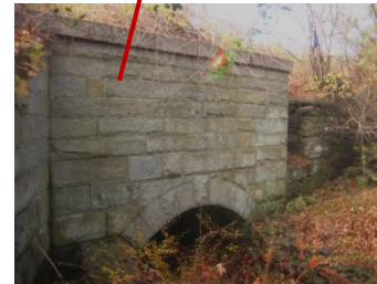
Bartlett Pond Spillway