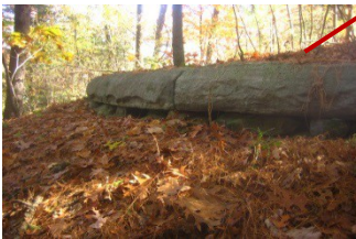
Top of Cistern