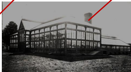
Greenhouse (now Central One Credit Union)